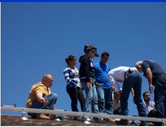
Participants at the first training session

Question: How many people does it take to install a solar photovoltaic system on the home of a farm-worker?