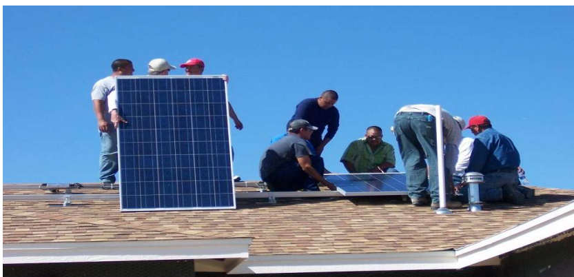
First solar panel installation by workshop participants